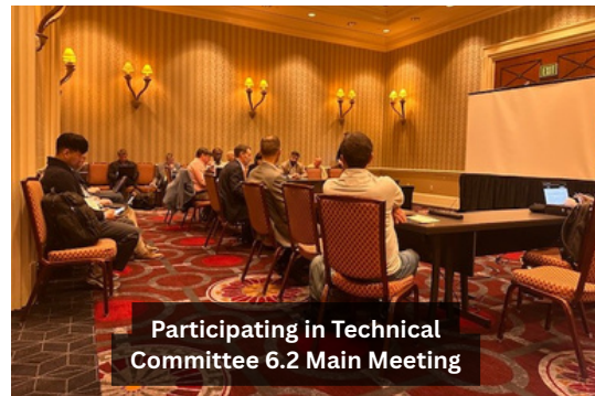
Participating in Technical Committee 6.2 Main Meeting