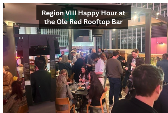
Region VIII Happy Hour at the Ole Red Rooftop Bar