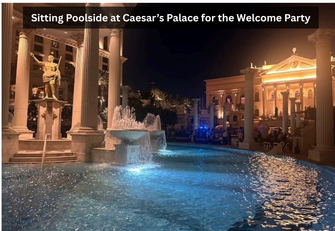
Sitting Poolside at Caesar's Palace for the Welcome Party